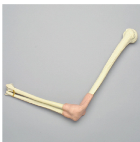
1411-2 Elbow joint